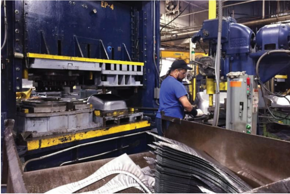
A production line employee works at the AMES Companies factory, the largest wheelbarrow factory in the world, in Harrisburg, Pennsylvania, U.S. on June 29, 2017.